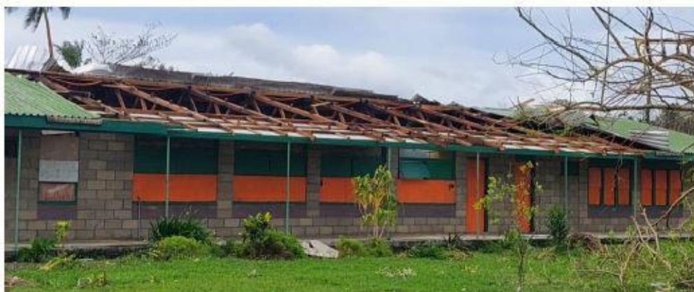
Onesua College Classroom roof destroyed by Cyclone Kevin in March

Category 4 Tropical Cyclones Judy and Kevin hit Vanuatu within 48 hours of each other on March 1 and 3 2023. The Presbyterian Church of Vanuatu has taken some time to gather information about damage to schools, churches and other property as a result of these cyclones. Many roofs were ripped off and water damage was sustained as a result, along with other impacts. Due to the isolated nature of many of Vanuatu's islands it has not been easy getting all these details together. But information recently received has estimated that repairs to PCV property on several affected islands will cost at least NZD $320,000. Onesua Presbyterian College on Efate Island was assessed separately and needs extensive repairs. This has not yet been costed but will be high.