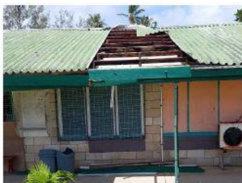
Onesua College - Roof Damage on Computer Lab