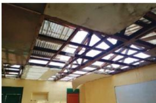
Onesua College – Damage to Junior Science Lab