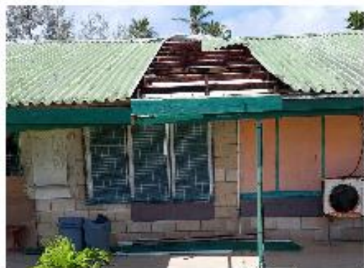
Onesua College - Roof Damage on Computer Lab