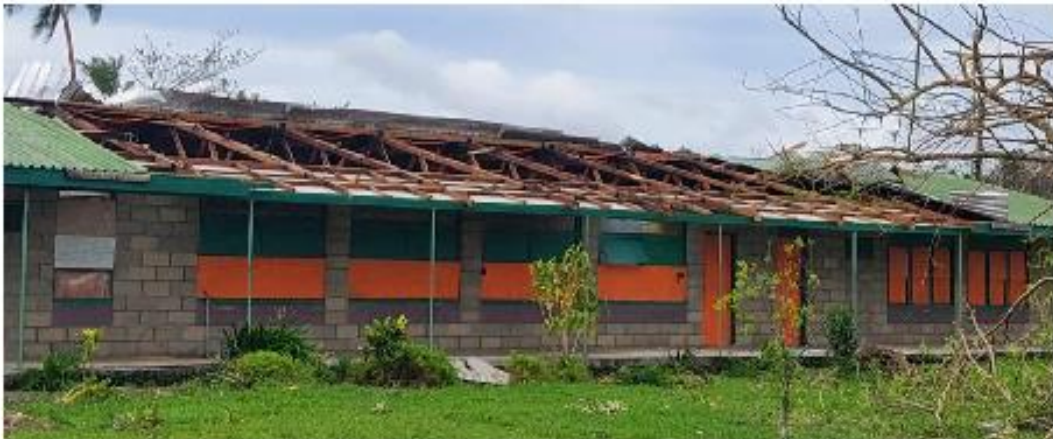
Onesua College Classroom roof destroyed by Cyclone Kevin in March

Category 4 Tropical Cyclones Judy and Kevin hit Vanuatu within 48 hours of each other on March 1 and 3 2023. The Presbyterian Church of Vanuatu has taken some time to gather information about damage to schools, churches and other property as a result of these cyclones. Many roofs were ripped off and water damage was sustained as a result, along with other impacts. Due to the isolated nature of many of Vanuatu's islands it has not been easy getting all these details together. But information recently received has estimated that repairs to PCV property on several affected islands will cost at least NZD $320,000. Onesua Presbyterian College on Efate Island was assessed separately and needs extensive repairs. This has not yet been costed but will be high.