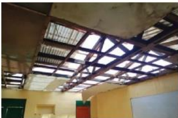
Onesua College – Damage to Junior Science Lab