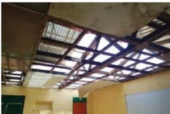
Onesua College – Damage to Junior Science Lab