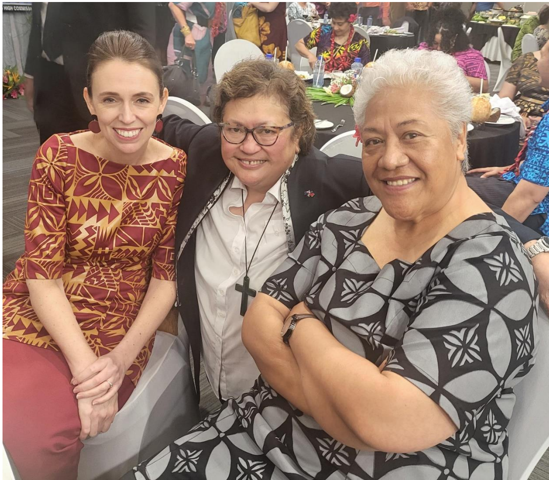
Two Prime Ministers and a minister at 60th Anniversary of Treaty of Friendship between Samoa and New Zealand 1-2 August 2022.