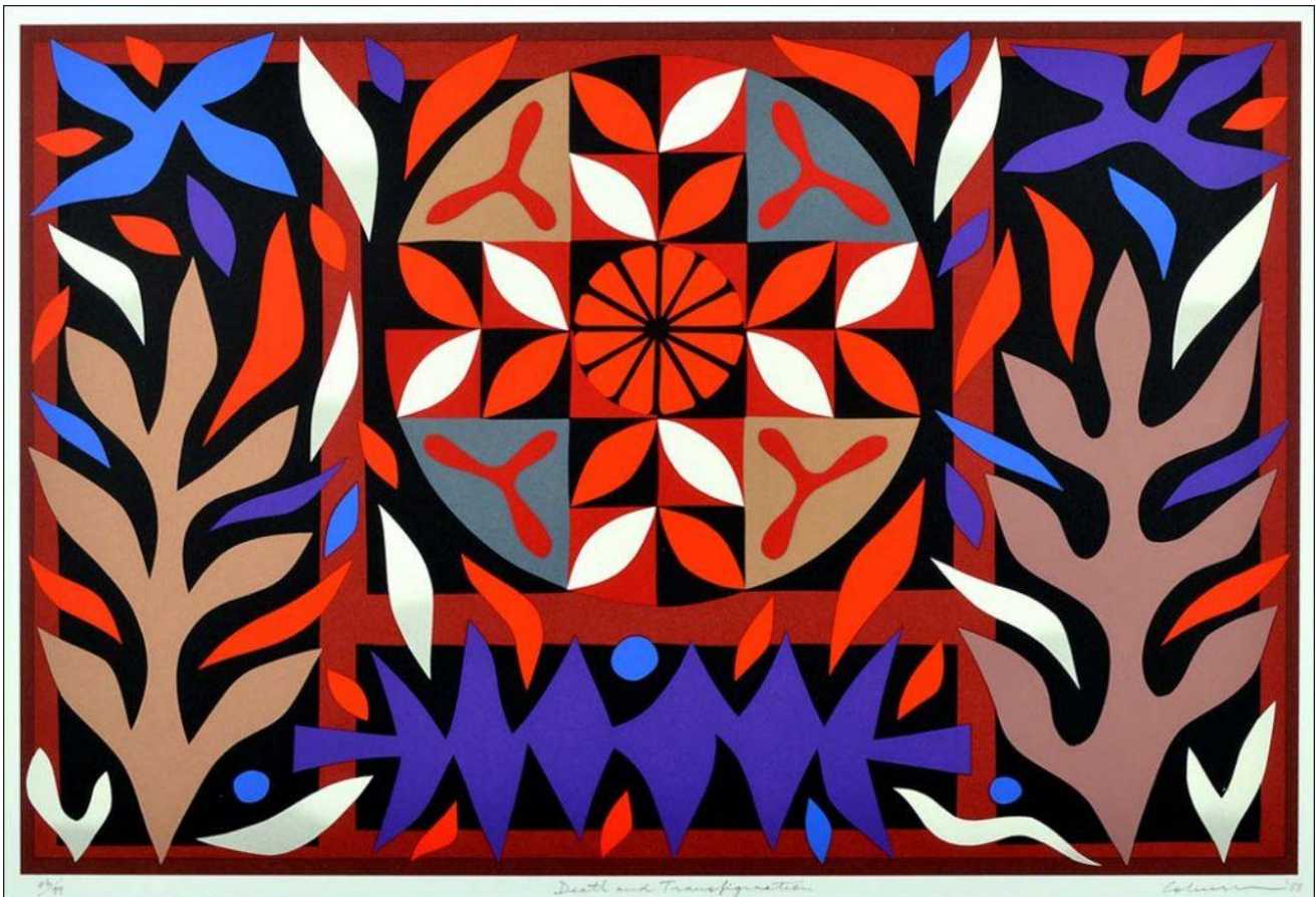
Death and Transfiguration 1988, John Coburn