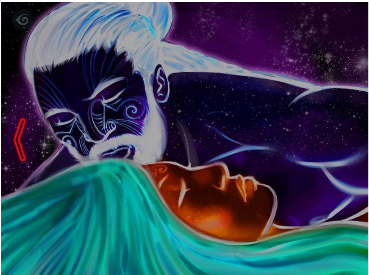
Rangi and Papa