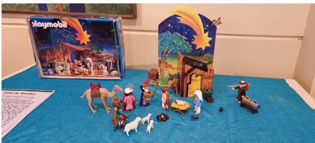
Jasper and Kezia arranged this nativity scene

From 10 January the office will be the first point of contact.