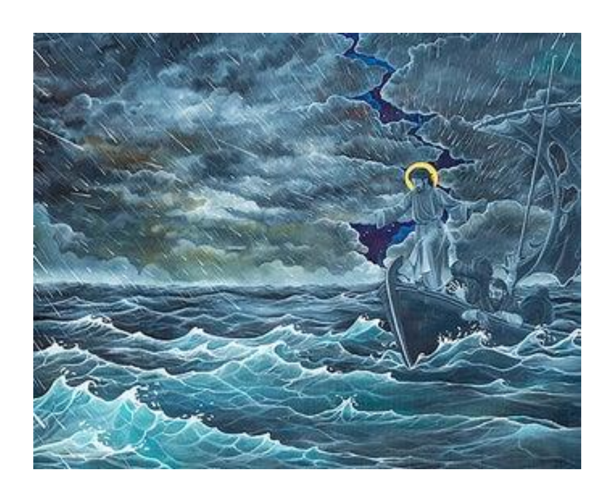
The Silencing of the Storm