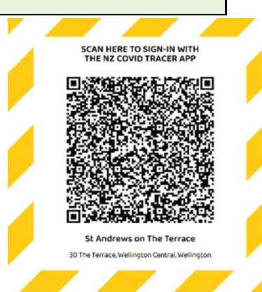
Sign-in. Stop the virus.