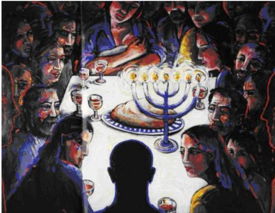
FIG 8: MARGARET ACKLAND, THE LAST SUPPER, 1993, ACRYLIC. FROM FISHER, JUDI, AND WOOD, JANET (EDS), A PLACE AT THE TABLE: WOMEN AT THE LAST SUPPER, JOINT BOARD OF CHRISTIAN EDUCATION, MELBOURNE, 1993.