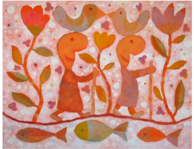
Pilgrims —Michael Leunig