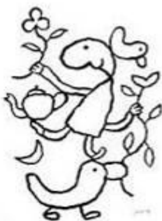
Holy Fool with Teapot

Only in recent times have I come to realize that what I have been so constantly depicting is the world of the holy fool: the people, the creatures, the circumstances and the peculiar ecosystem of the spirit. If you yearn for something you may end up creating it. –Michael Leunig