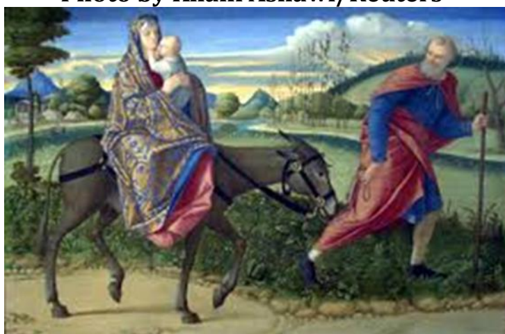
Mary, Joseph and child 'The Flight into Egypt' Vittore Carpaccio (1466-1525)