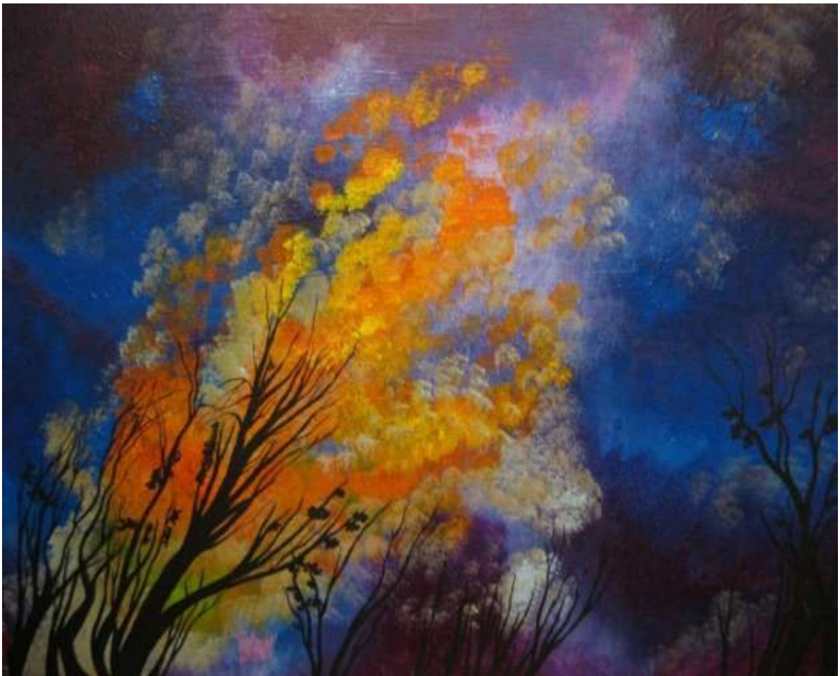
The Burning Bush by Sophia Tabak