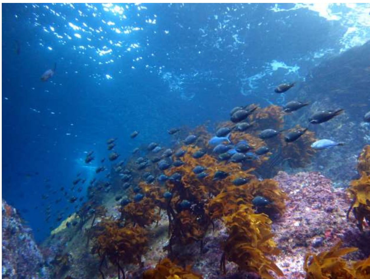
Blue Mao Mao, Poor Knights Islands Marine Reserve.