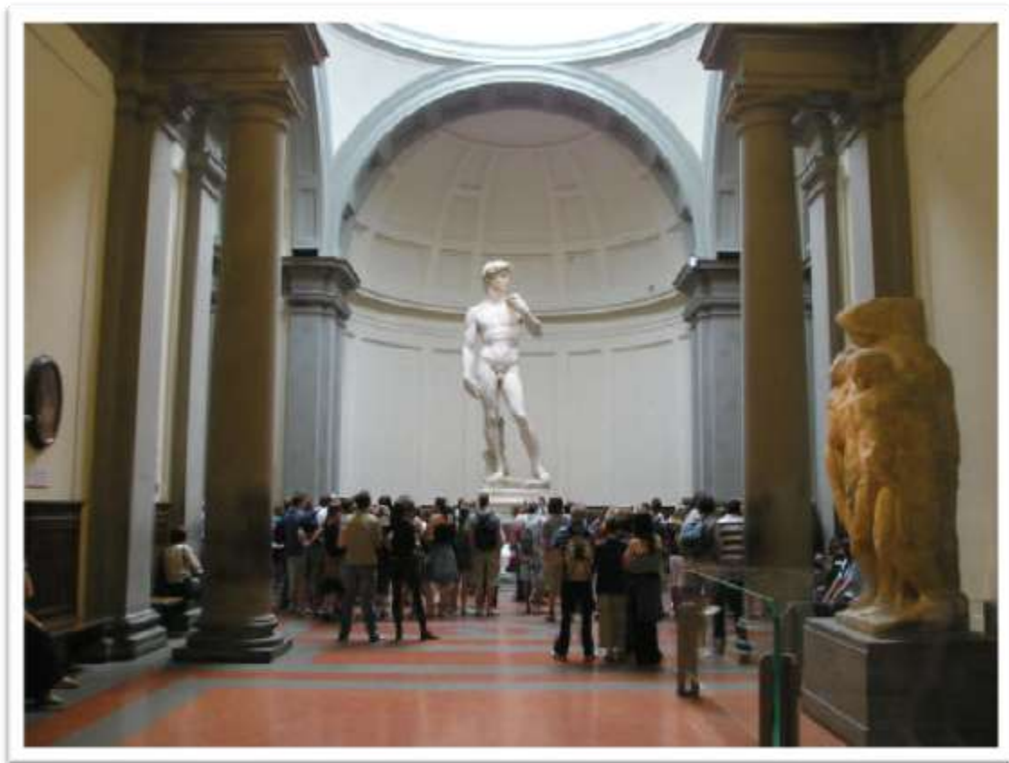
The statue of David by Michelangelo